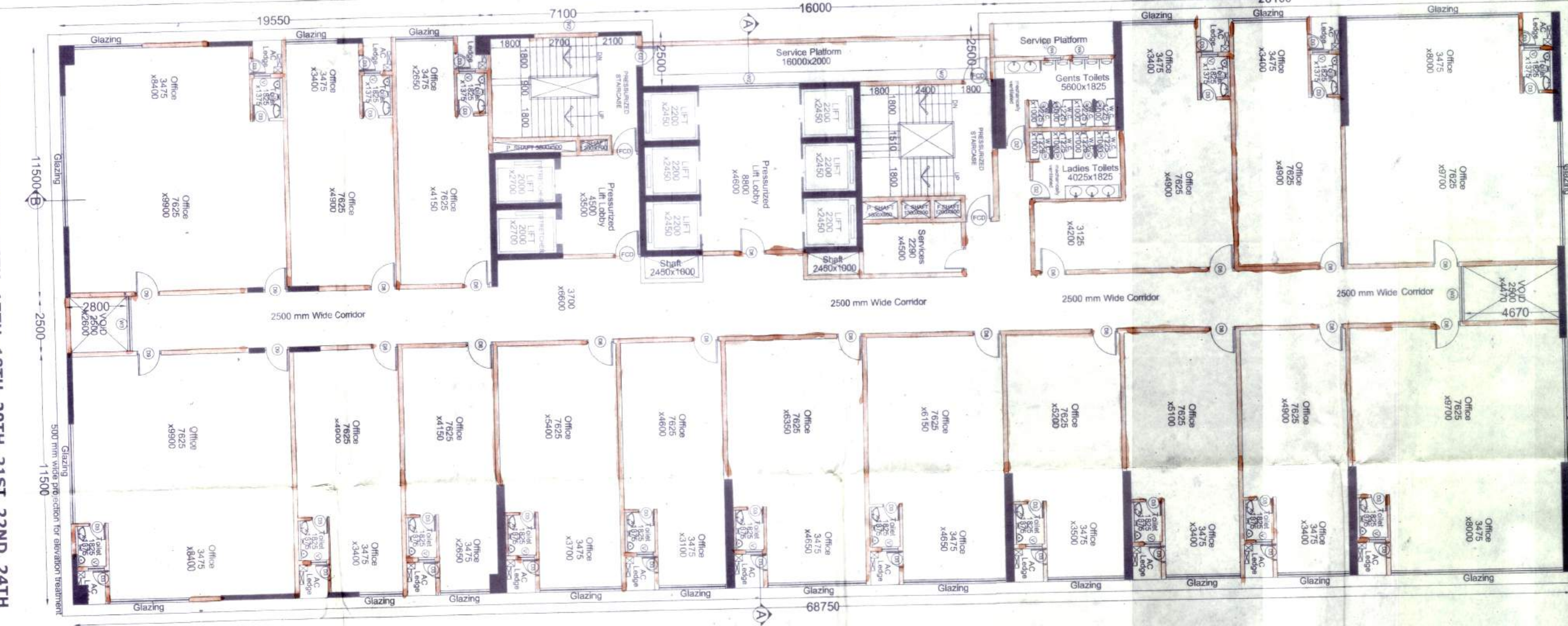
12TH, 13TH, 14TH, 16TH, 17TH, 18TH, 20TH, 21ST, 22ND, 24TH & 25TH FLOOR PLAN SCALE:1:100